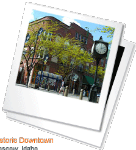
Historic Downtown Moscow, Idaho