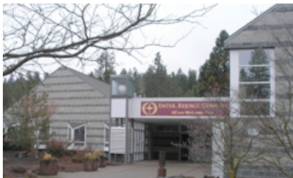
Unitarian Universalist Church of Spokane

A rich learning experience, with lunch provided, is in store in Spokane on Jan. 25 and Pasco on Feb. 8 for ALL Toastmasters in District 9 (not just club officers) – at no cost to you beyond transportation. Register here .